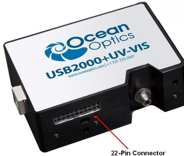
Location of USB2000+ Accessory Connector

The USB2000+ features a 22-pin Accessory Connector, located on the front of the unit as shown: